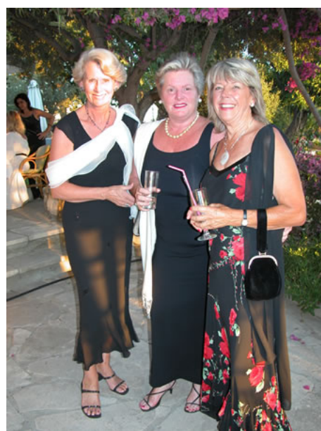
Some people took the 'posh frocks' dress code VERY seriously!

Feedback has been terrific and Rod and Christina have a super programme scheduled until year-end.