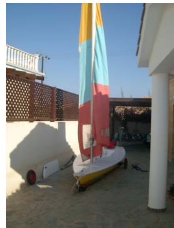
Laser dinghy No 2663!